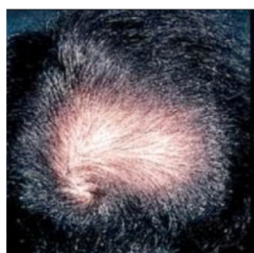
Before treatment (baseline)